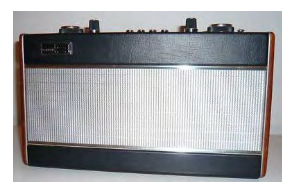
Roberts R707, good coverage on 49 and 41m bands

Well, some persons don't hang about reading this do they – you know who you are, no names and definitely no pack drill for this member who emailed me writing, "I picked up a copy yesterday. Interesting photograph of the Roberts Radio in the flat eh? That particular model covers 41 & 49m broadcast bands, so I assume you can work out the rest. Anyone got any logs of that particular day?"